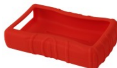
41822 red skin

Please contact Coomber to place your order now!