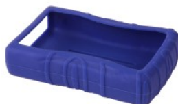
41821 blue skin

We also produce a comprehensive range of accessories that can help you get more from your Coomber: